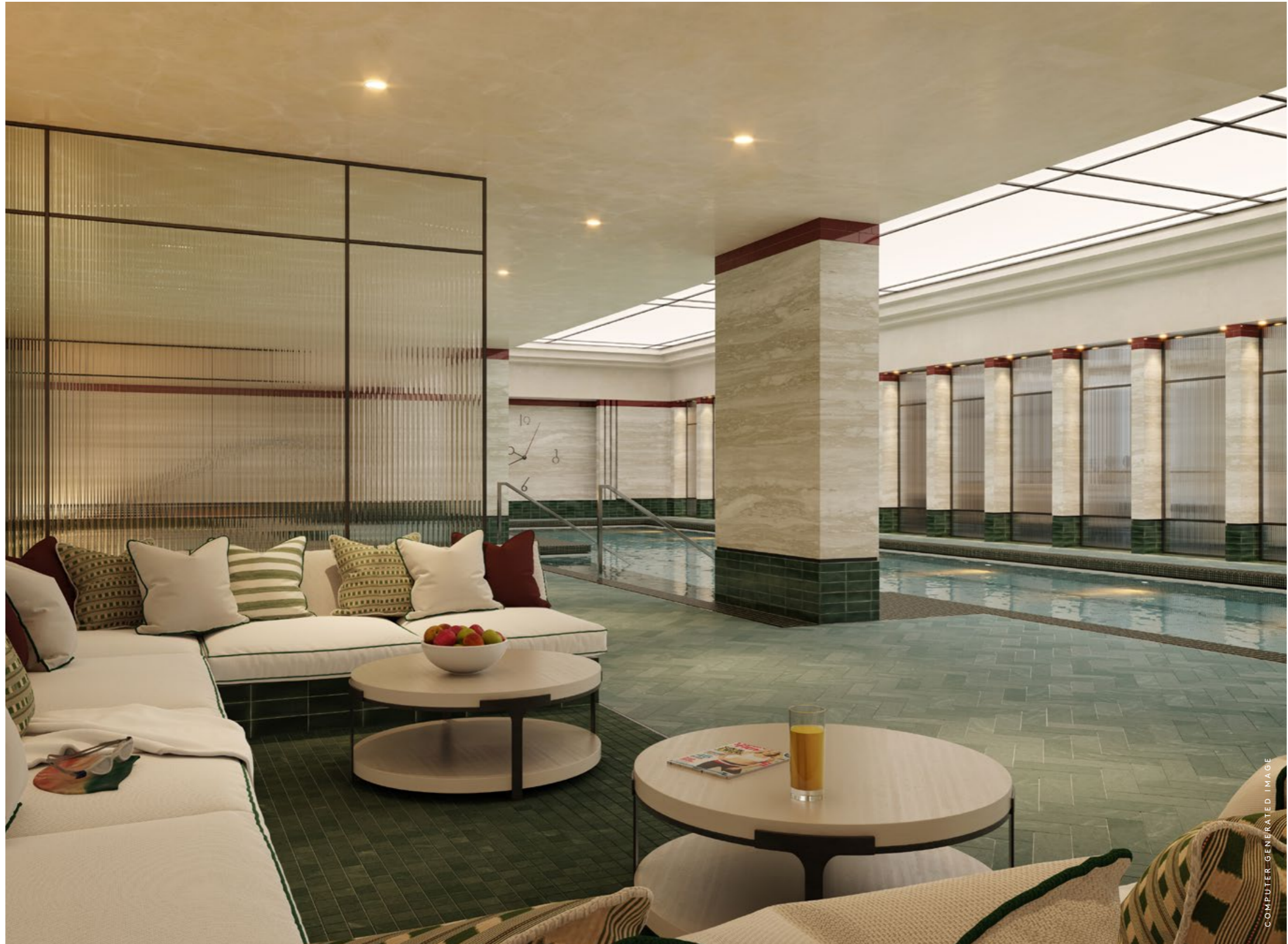
SWIMMING POOL SEATING AREA