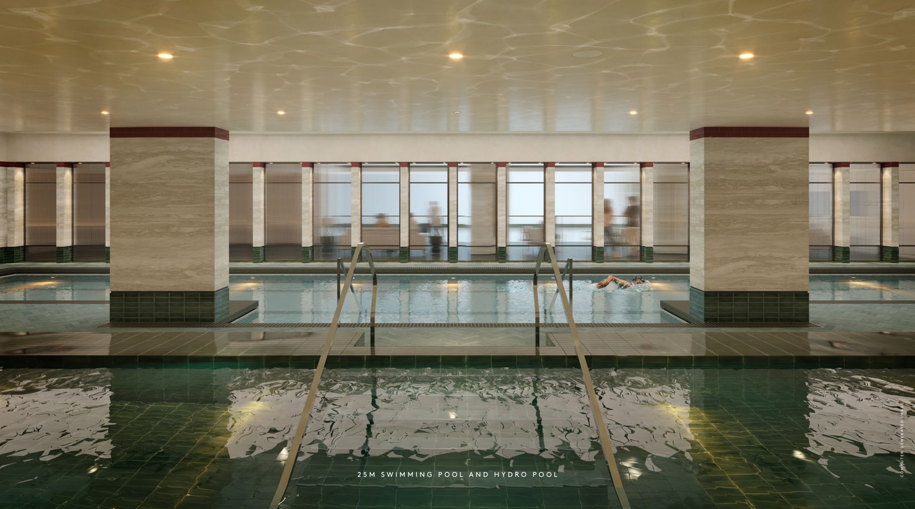
25M SWIMMING POOL AND HYDRO POOL