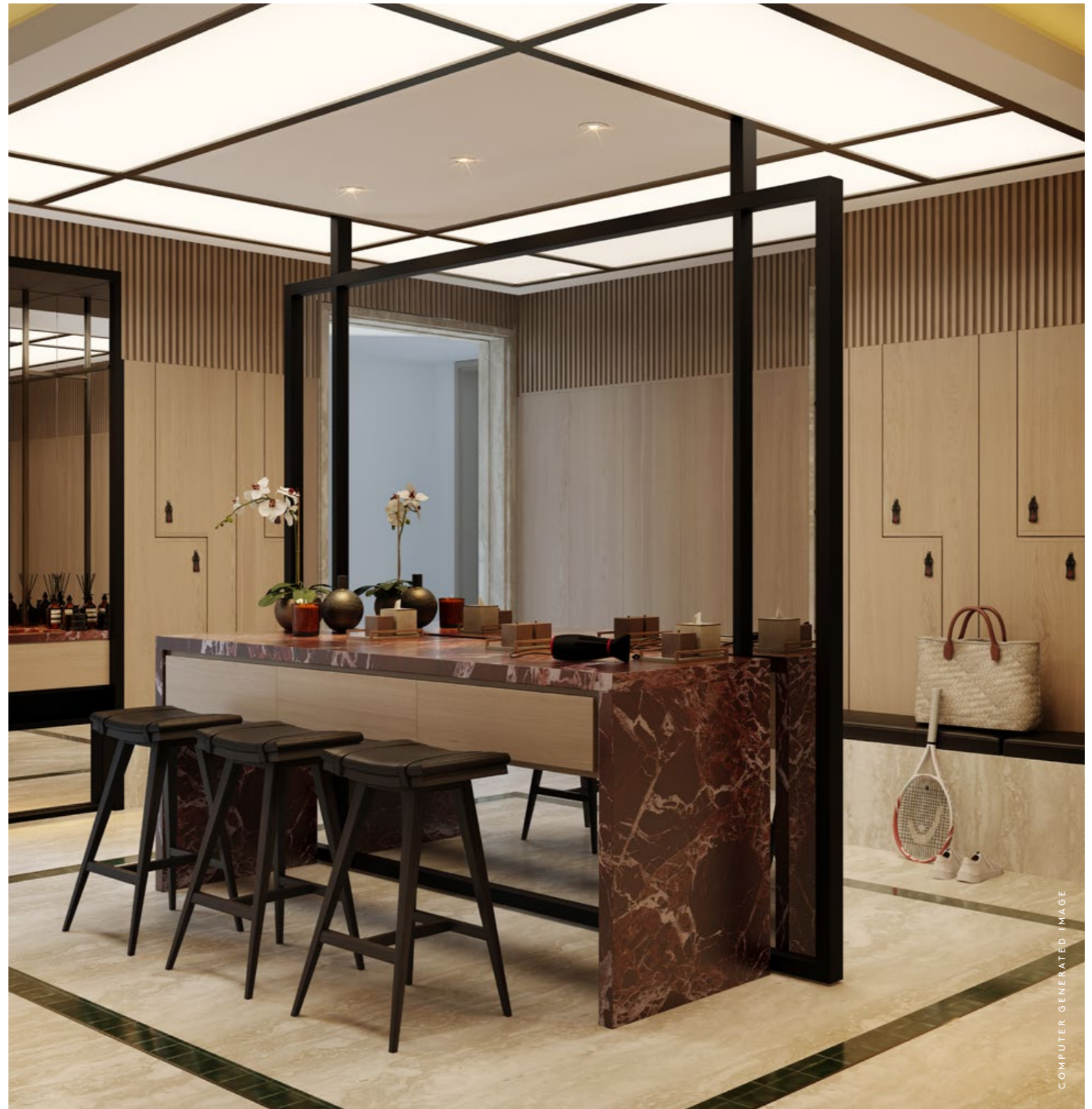
FEMALE CHANGING ROOM