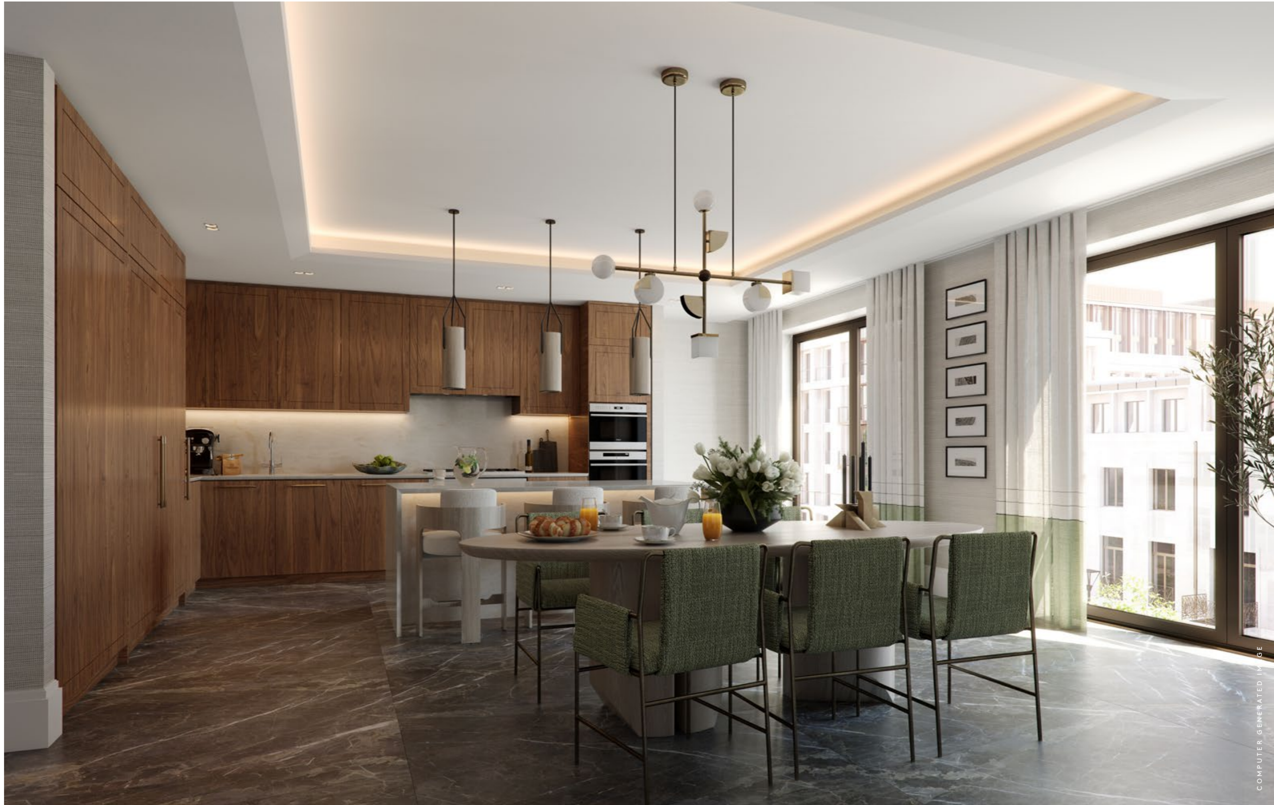
KITCHEN / DINING