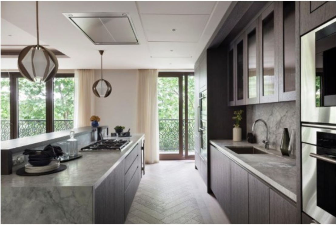
Streamlined kitchen ALEXANDER JAMES

Chelsea Barracks’ residential buildings take inspiration from the formal Georgian squares of Belgravia. The buildings are positioned around a series of landscaped public routes and spaces, ensuring that they are accessible to the local community and evolve as a natural addition to Belgravia.