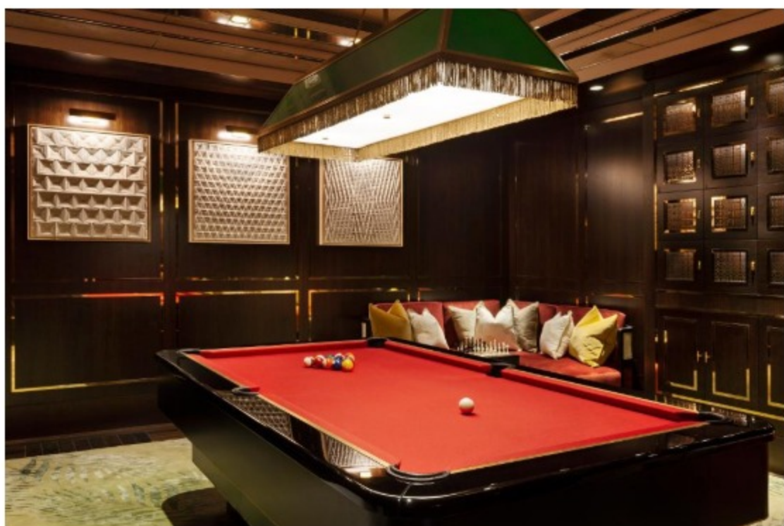
Billiards room ALEXANDER JAMES

The four-bedroom, four-bathroom model home was designed by Elicyon , a London-based luxury interior design studio based in Kensington, London. The unit features eclectic furnishings that have been combined with textured materials, antiques and natural greenery to create a design that speaks to the history of Chelsea Barracks as a military site and reflects Belgravia’s heritage and botanical links.