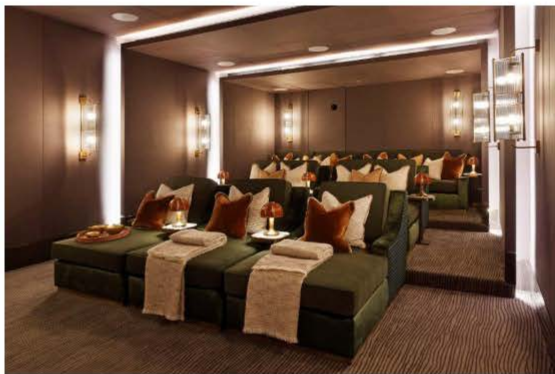
Cinema at Chelsea Barracks ALEXANDER JAMES

In addition to its mix of housing and gardens, Chelsea Barracks will showcase a wide array of amenities upon completion, including restaurants, shops and fitness amenities. The Garrison Club, which opened in November, is a state-of-the-art health club and spa. It features a 13,000-square-foot spa, a nearly 70-foot-long swimming pool, his and hers steam rooms and saunas, a gym, private training studio, beauty center, 16-seat movie theater, residents' lounge, full business suite, game rooms and underground parking garage.