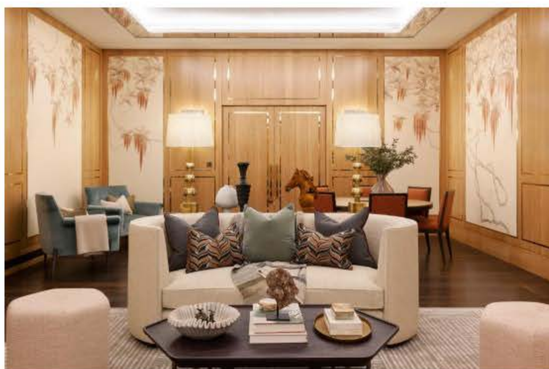
Residents lounge ALEXANDER JAMES

While rooted in the heritage and context of the local area, the architecture of Chelsea Barracks is distinctly contemporary. Building facades are characterized by smooth and textured variations of Portland stone, fluted vertical columns, recessed bays and projecting balconies. Portland stone has been used extensively in major public buildings in London such as St. Paul's Cathedral and Buckingham Palace.