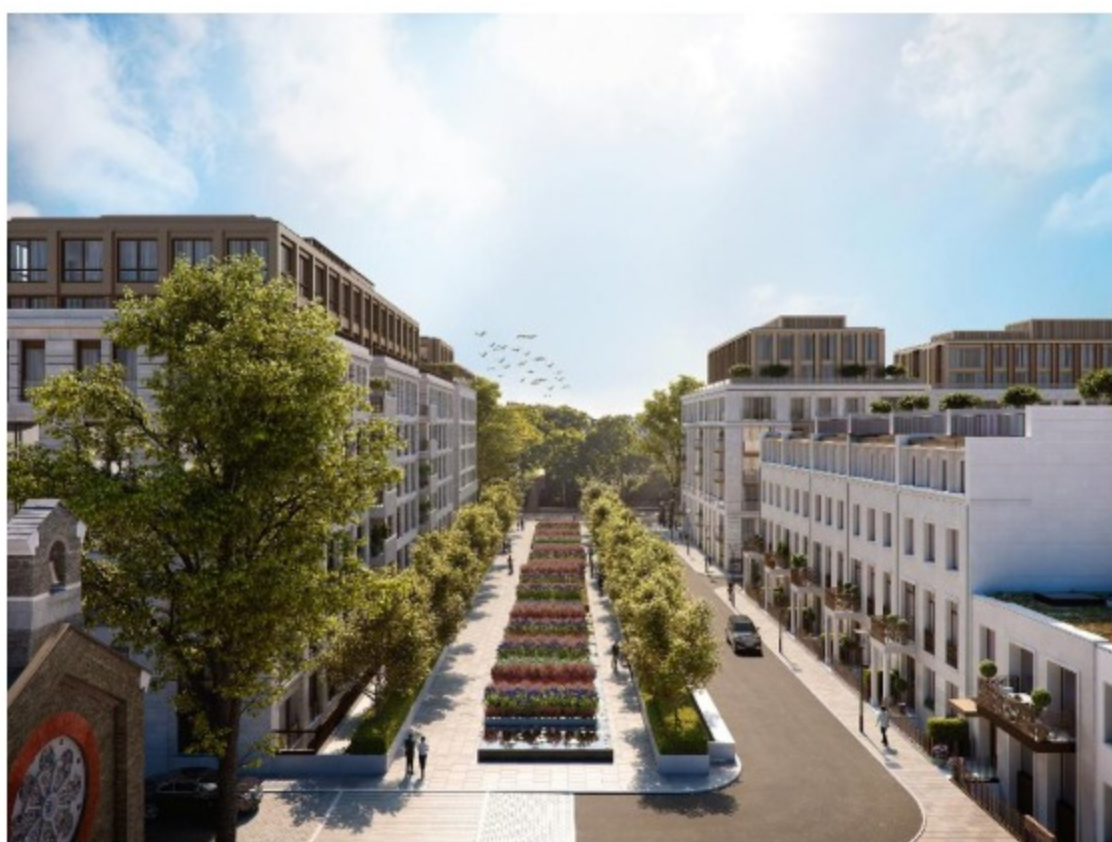
Public square inspired by the traditional garden squares of Belgravia

The four-bedroom, four-bathroom model home was designed by Elicyon , a London-based luxury interior design studio based in Kensington, London. The unit features eclectic furnishings that have been combined with textured materials, antiques and natural greenery to create a design that speaks to the history of Chelsea Barracks as a military site and reflects Belgravia’s heritage and botanical links.