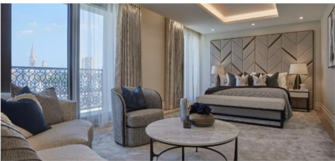
Master bedroom