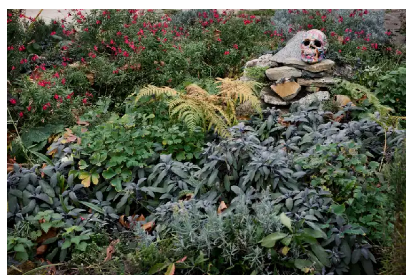
Crossbones Gardens: once a post-medieval cemetery, now a precious part of the local community for quiet contemplation

Discover Bankside's Crossbones Gardens. Once a post-mediaeval cemetery, the garden is now a precious part of the local community for quiet contemplation. It's usually only open three lunchtimes a week but is operating extended hours this week. Tours of the garden are taking place on Friday 27th May at 12, 12.45 and 13.30.