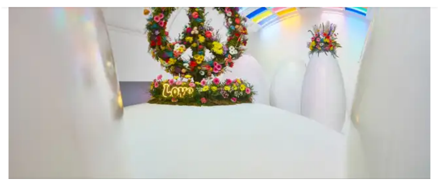
Sketch: installations include giant daisy chairs and a swing / Mark Cocksedge