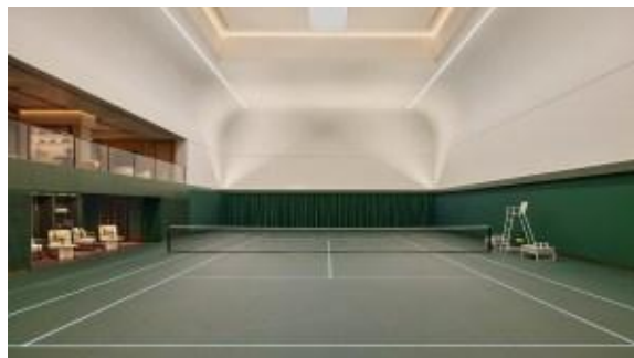
The Garrison Club's massive indoor tennis court.

Set in Belgravia, the new residences by Eric Parry Architects are the first in a trio of buildings planned for Chelsea Barracks' next phase. It includes 48 homes that range from one-bedroom units to five-bedroom penthouses, with 50 percent of them already in contract. There's no word on how much the most expensive apartments will cost, but we do know that one-bedroom units start at $4.5 million. Naturally, there's more to expect at the Central London property, which has a sprawling club that houses amenities like an 82-foot swimming pool.