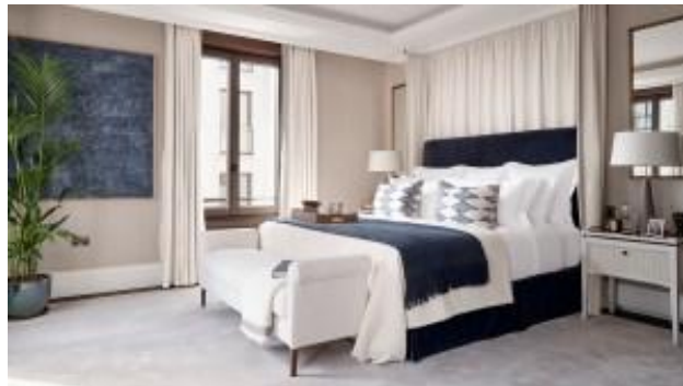
Inside a primary bedroom at Chelsea Barracks.

A further peek inside grants views of a culinary garden designed by Gustafson Porter as well as Garrison Square, which offers access to nearby alfresco dining and exhibition spaces. Chelsea Barracks claims its next phase will allow it to offer a total of 97 new residences across all three structures.